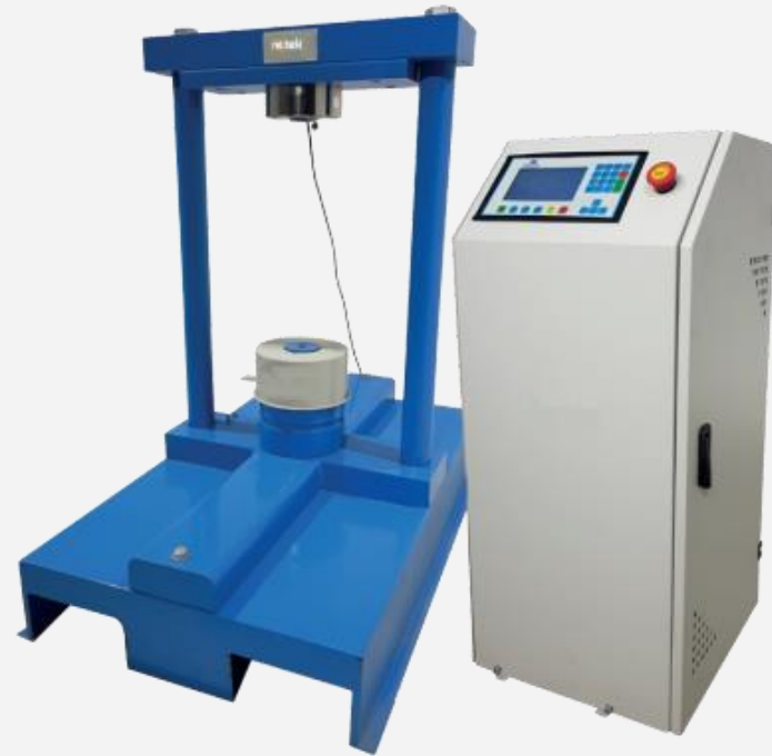
AUTOMATIC FLEXURAL TESTING MACHINES