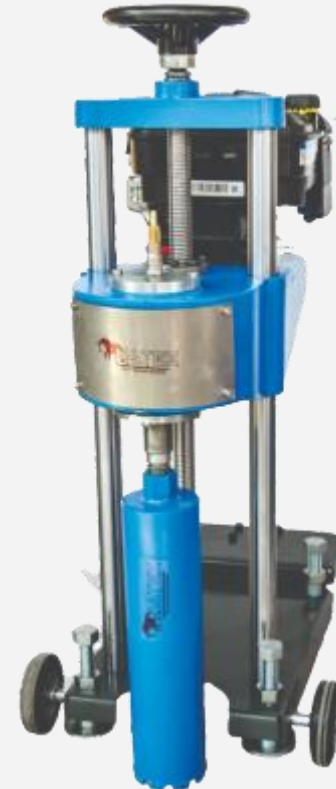
Pavement Core Drilling Machine