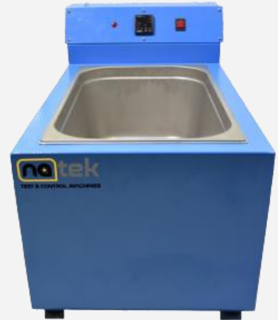
Marshall Water Bath ...and much more!