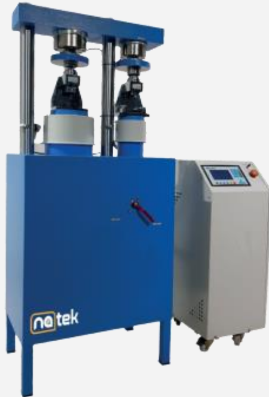
CEMENT COMPRESSION FLEXURAL TEST MACHINE