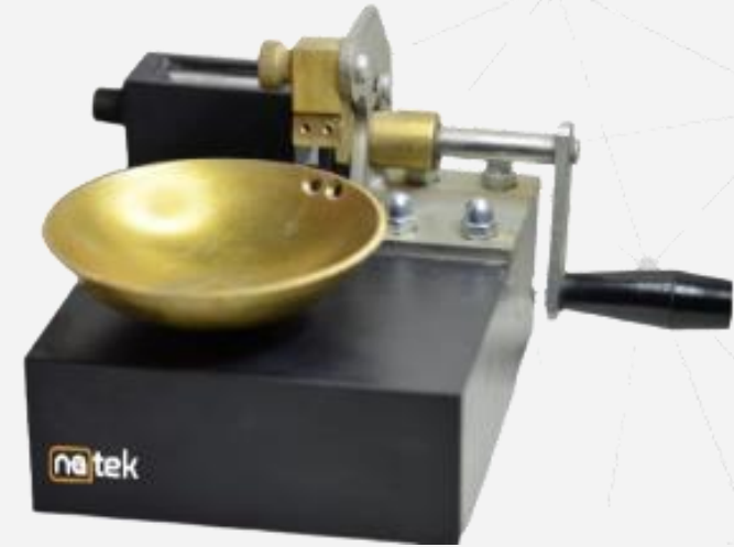
LIQUID LIMIT DEVICE