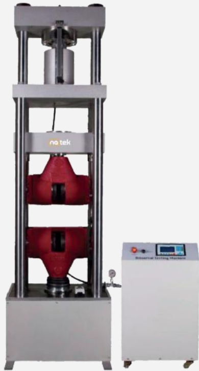
UNIVERSAL TESTING MACHINES