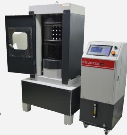
AUTOMATIC CORE-ROCK COMPRESSION TESTING MACHINE