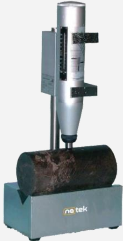
ROCK CLASSIFICATION HAMMER (LOW IMPACT ENERGY MODEL)