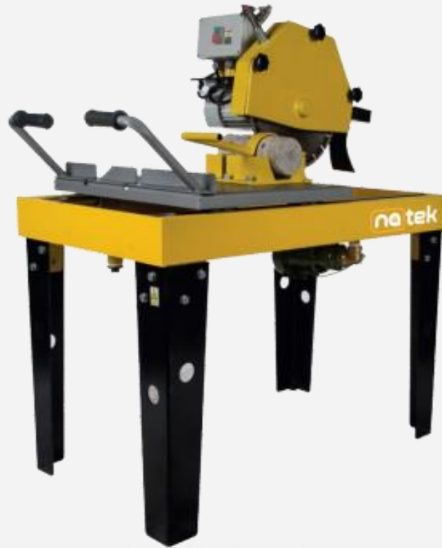
MASONRY SAW ( SPECIMEN CUTTING MACHINE )