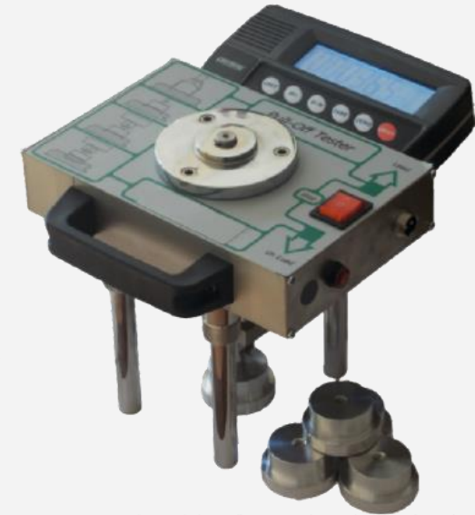
SEMI-AUTOMATIC PULL-OF TESTER