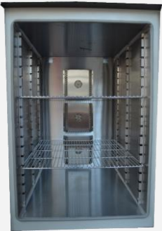
LABORATORY DRYING OVENS ( FORCED CONVECTION )