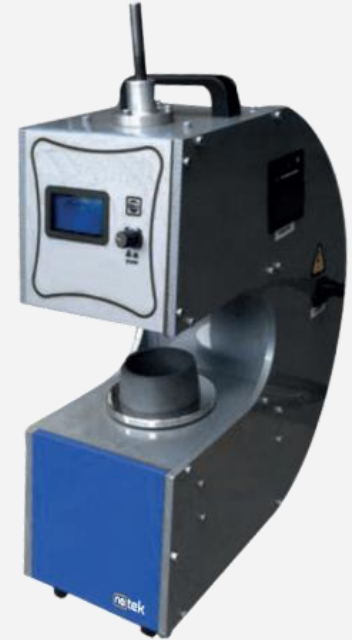
AUTOMATIC VICAT TEST SET