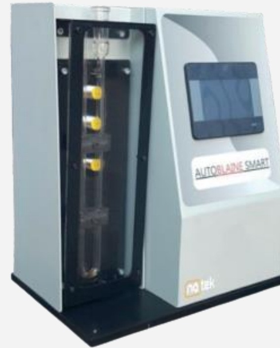
AUTOMATIC BLAINE AIR PERMEABILITY APPARATUS