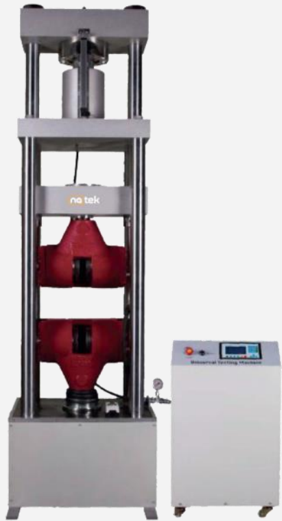
UNIVERSAL TESTING MACHINES