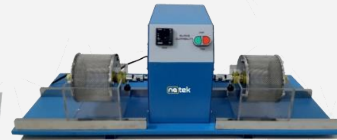
SLAKE DURABILITY APPARATUS