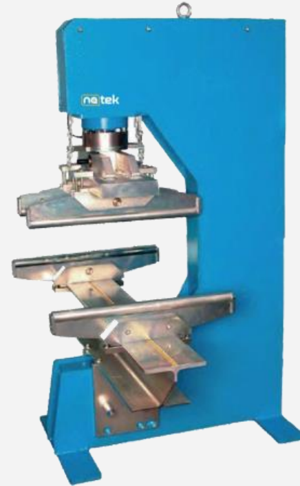
FLEXURAL TESTING FRAMES