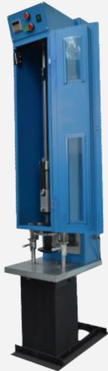
Automatic Marshall Impact Compactor Astm