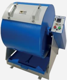
LOS ANGELES ABRASION MACHINE