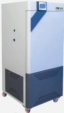
FREEZING AND THAWING CHAMBERS