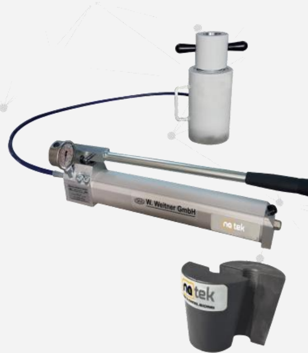
PULL OUT TEST APPARATUS