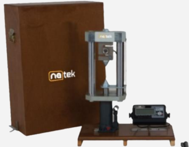
DIGITAL POINT LOAD TESTER (ROCK STRENGTH INDEX)