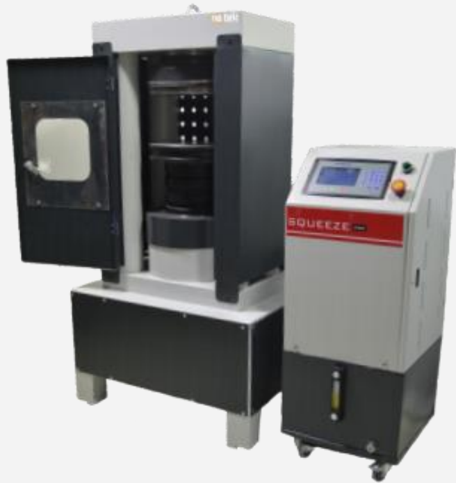
AUTOMATIC CONCRETE COMPRESSION TESTING MACHINES WELDED WALL