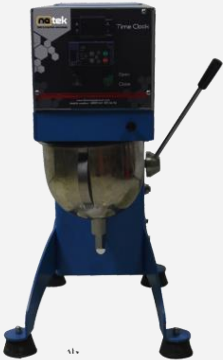
Laboratory Asphalt Mixer