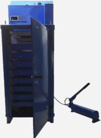
HIGH CAPACITY SIEVE SHAKER