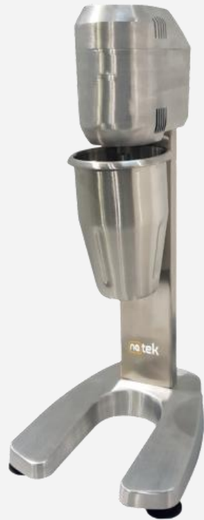
PARTICLE SIZE ANALYSIS OF SOILS