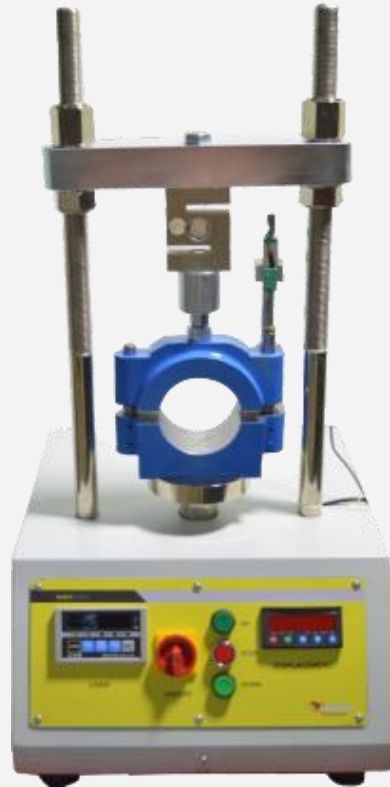
Marshall Stability Test Machine